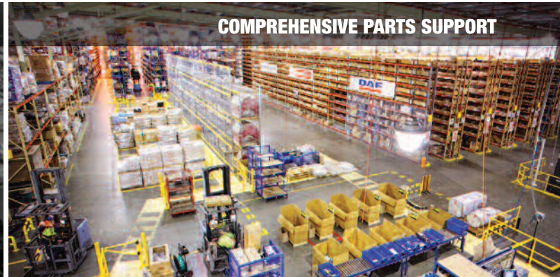
COMPREHENSIVE PARTS SUPPORT