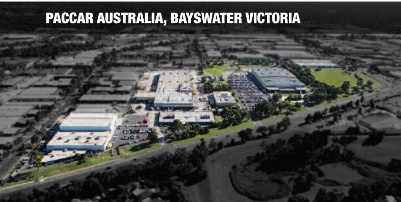
PACCAR AUSTRALIA, BAYSWATER VICTORIA