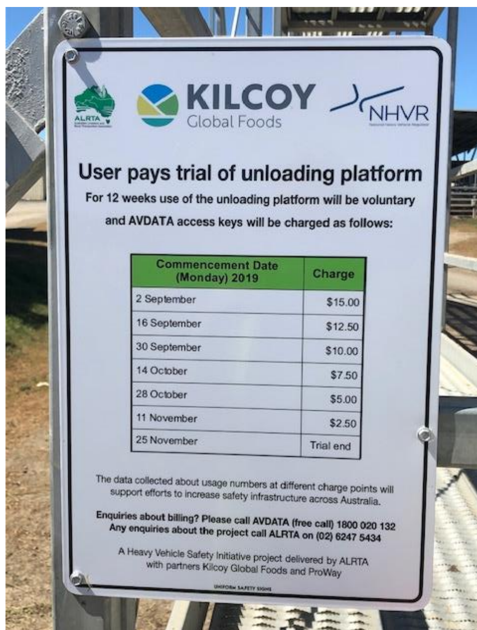
Figure 2: Signage on the Crate P.A.L. showing pricing during the trial period.

Usage of the Crate P.A.L. was encouraged but entirely voluntary throughout the trial period.