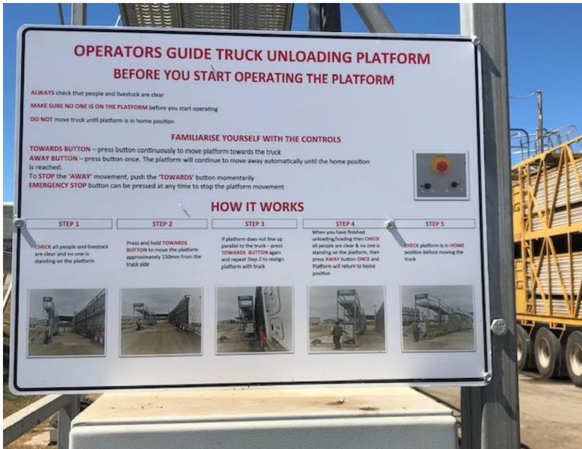
Figure 3: Signage installed at control panel of the Crate P.A.L.

An official launch and media release were also undertaken during the trial involving the Federal Assistant Minister for Road Safety and Freight Transport (the Hon. Scott Buchholz MP), NHVR CEO, KGF Chief Operating Officer, LRTAQ Vice President, ALRTA Executive Director and several local transport operators.