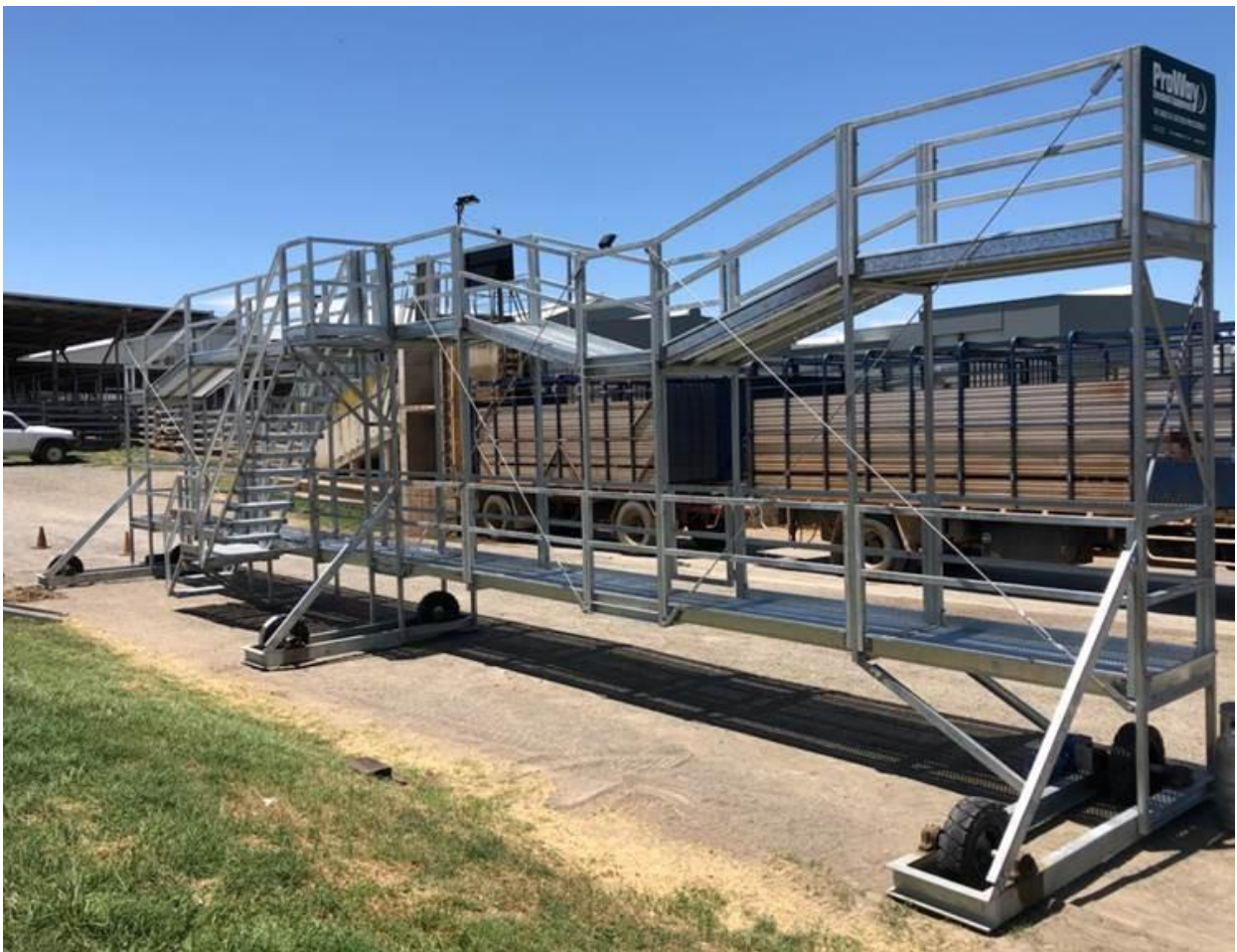
Figure 1: The Parallel Crate P.A.L. at Kilcoy Global Foods Australia.

The Crate P.A.L. moveable gantry, designed by ProWay, is acknowledged as a best practice safety innovation in livestock unloading at high volume destinations. The frame's platforms and gates provide users with safe access to the side panels and gates of livestock crates, keeping people and animals separated at all times. The Crate P.A.L.'s walkways, stairways and handrails comply with Australian Standards and the gantry is quick to engage and disengage, it is driven by an electric motor that moves the frame to and from the side of trailers. The Crate P.A.L. is designed to be used on level ground with the wheels running on either concrete, bitumen or compacted gravel.