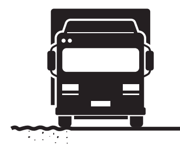
Braking when wheels face uneven friction, like one side leaving the pavement