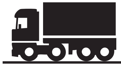
With moving loads