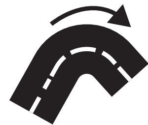
When the corner tightens unexpectedly